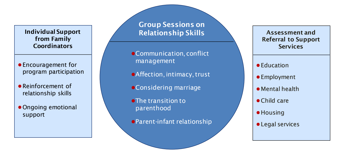
Figure ES.1. The BSF Program Model

BSF programs had three components: (1) group sessions on relationship skills, (2) individual support from family coordinators, and (3) assessment and referral to support services (Figure ES.1). The core service was relationship skills education offered in group sessions. The BSF model did not require a specific curriculum to guide these sessions, but required programs to use a curriculum that covered key topics specified by the program model. The eight BSF programs chose one of three curricula developed for the study by experts who tailored their existing curricula for married couples to the needs of unmarried parents. The relationship skills education was designed to be intensive—involving 30 to 42 hours of group sessions. Not all couples who enrolled in BSF participated in these sessions, however. Overall, 55 percent of couples offered BSF services attended a group session. Among those who did attend, couples averaged 21 hours of attendance at these sessions. BSF offered other services to participating couples. Under the program model, a family coordinator assigned to each couple was to reinforce relationship skills, provide emotional support, and encourage participation in the group sessions. The family coordinator also assessed family members' needs and referred them for appropriate support services. The average cost of BSF per couple was about $11,000 and ranged from approximately $9,000 to $14,000 across the eight programs.