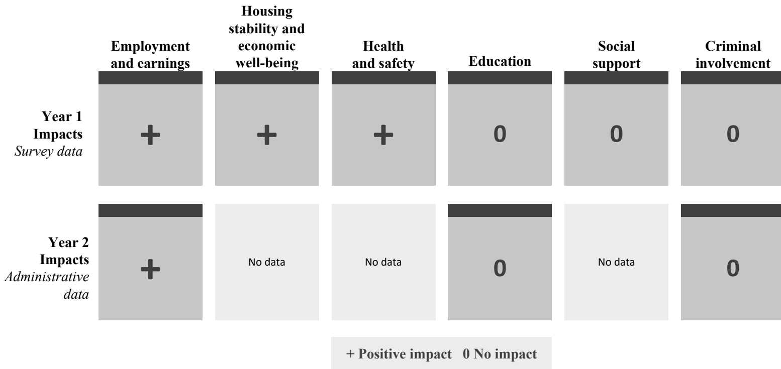
Figure 1 Outcome Domains Assessed and Impacts Observed in Each Follow-Up Year of the Youth Villages Transitional Living Evaluation

NOTE: The evaluation does not include a two-year follow-up survey. Administrative data for three of the domains that were included in the one-year analysis — housing stability and economic well-being; social support; and health and safety — do not exist, are difficult to obtain, or do not fully measure relevant outcomes. Thus, the research team was unable to assess two-year impacts in these three areas.